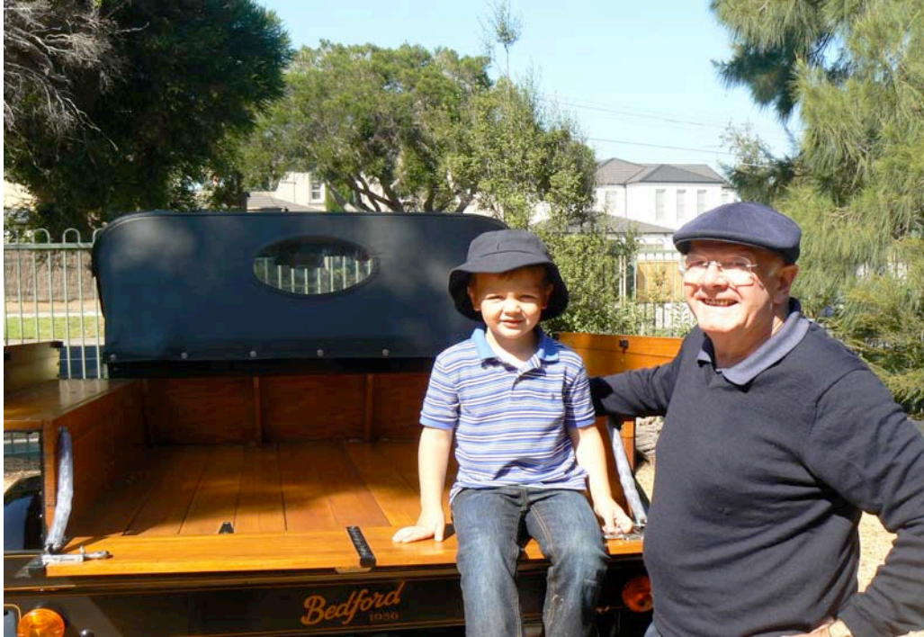
A special visit from "Brum" in Red Group